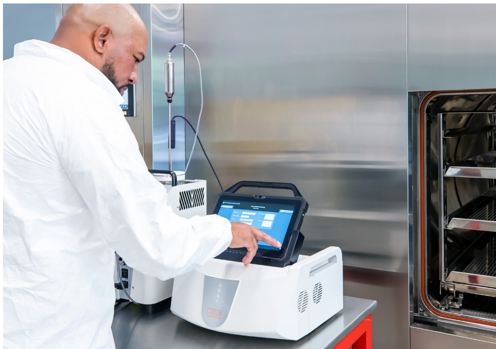
Kaye – ensuring the safety and health of Pharmaceutical / Biotech consumers worldwide