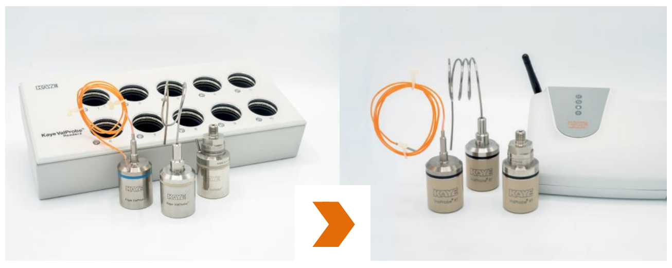
ValProbe® RT ValProbe<sup>®</sup>

Authorized firmware copies are available only through Kaye or a Kaye Authorized Service Center for download.