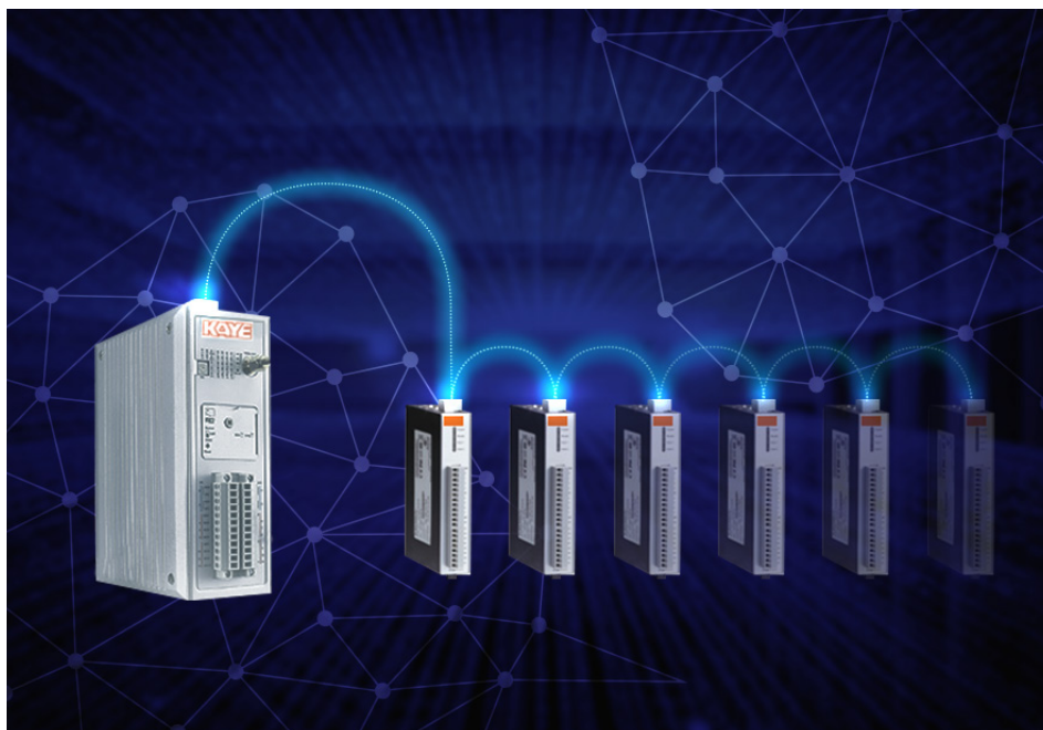
Netpac II Monitoring Solution – Cloud ready with built in redundancy

LabWatch is your one stop software shop for all environmental monitoring that is subject to Pharmaceutical regulatory scrutiny, and with over 60 years of experience – Kaye can ensure that your investment keeps pace with updates to IT and GxP requirements. Don't be subject to failing an Audit!