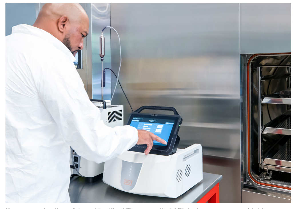
Kaye – ensuring the safety and health of Pharmaceutical / Biotech consumers worldwide