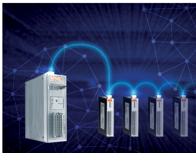
Netpac II Monitoring Solution – Cloud ready with built in redundancy

LabWatch is your one stop software shop for all environmental monitoring that is subject to Pharmaceutical regulatory scrutiny, and with over 60 years of experience – Kaye can ensure that your investment keeps pace with updates to IT and GxP requirements. Don’t be subject to failing an Audit!